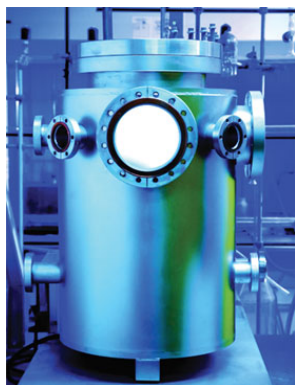
Chemical vapor deposition (CVD) reactor

Carbon nanostructures have significant potential for uses ranging from strengthened composites to field-effect transistors and electronic circuitry.